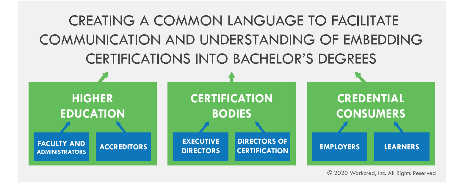
Figure 1: Creating a Common Language

Across all of the convenings, the information received through the use of surveys showed an increased understanding by attendees of the university curriculum development process and the certification exam development process after attending a convening. In particular, very few—and sometimes no—respondents indicated that they still did not understand these processes.<sup>10</sup> Additionally, changes from pre-convening survey responses to post-convening responses for other questions strongly suggest a more nuanced understanding of the value and ability of partnerships between certification bodies and universities. For example, there were some significant shifts in the number of respondents who selected it was "very possible" to align university curriculum and certification exam content, reflecting a change in viewpoint due to participation in the convenings. Fostering a better understanding and actively using a common language about credentials (see Figure 1: Creating a Common Language) was critical to facilitating constructive conversations, and ultimately served to strengthen the relationship between the university and certification body attendees.